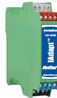
IAdapt Module 617-07160