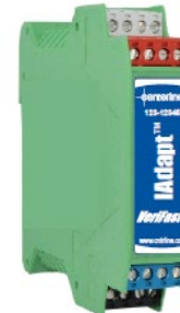
IAdapt Module 617-07160