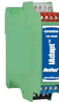
IAAdapt Module 617-07160